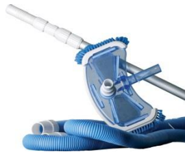
Limpiafondos manual Vacuum cleaners AR2064