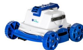
Robot Robot RKJ14