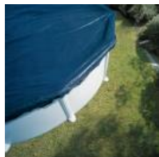
Cubierta de invierno Winter cover CIPR551